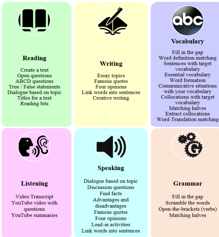
Figure 2. Capabilities of AI tools

formats is Diffit. It provides teachers with quickly generated resources. Diffit creates customised resources for ESP lessons, saving time and ensuring that all students can access content appropriate to their level. It can generate or adapt texts for any reading level, provide teachers and students with automatically generated summaries and comprehension exercises, extract vocabulary from any context, edit texts of varying complexity, create discussion questions, dialogues, and letters, identify quotes for any topic, and build a wide range of exercises. The self-paced course helps teachers learn how to use this versatile tool. Another similar, and even more popular, AI-powered tool for English teachers is Twee. Figure 2 illustrates the extent to which AI tools can support teachers’ work and enhance teaching efficiency (Twee, n.d.).